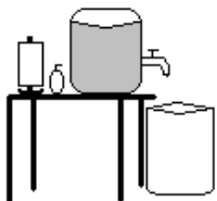
Hand Wash Station

I have read, understood, and completed this application. I understand that an incomplete application will be denied.